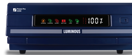
Power Pro 2250